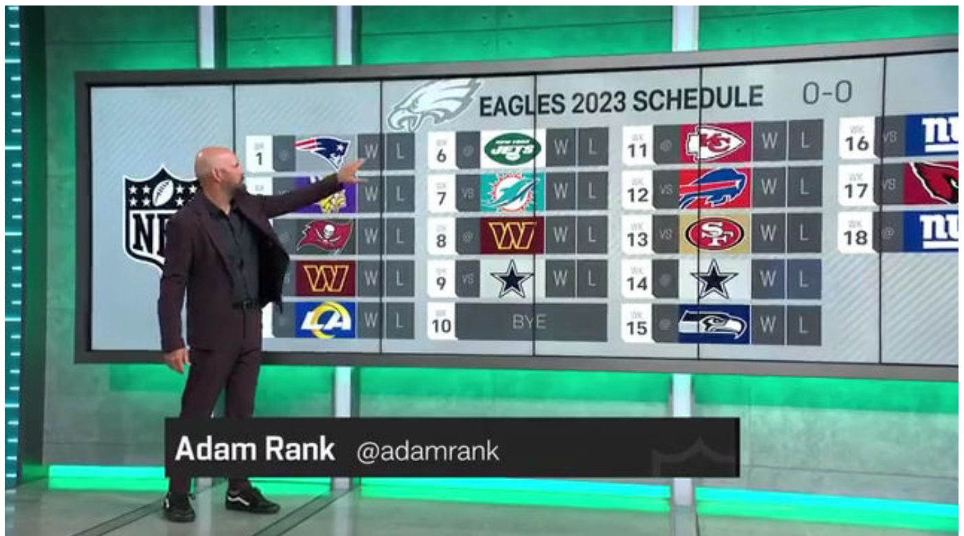
Adam Rank predicts Eagles' 2023 schedule 'NFL Total Access'

NO COMMENTS ON THIS ITEM PLEASE LOG IN TO COMMENT BY CLICKING HERE (/LOGIN.HTML?REFERER=%2FSTORIES%2FLUPUS-AWARENESS-TAKES-CENTER-STAGE-IN-UTICA%2C181367)